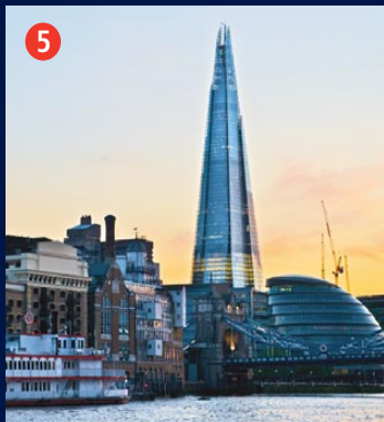
5 The Shard A daring concept by architect Renzo Piano, the Shard is Europe's tallest building at 309.6m (1016ft). Superb views from a gallery 245m up on the 72nd floor.