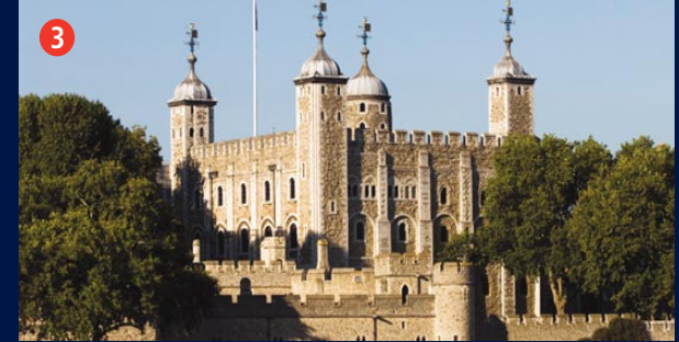
3 Tower of London The Tower dates back almost a thousand years, steeped in the history and intrigue of centuries. Home of the famous Beefeaters and the Crown Jewels.