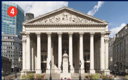
4 Royal Exchange The historic Royal Exchange, between the Bank of England and the Lord Mayor's Mansion House, is now home to the Grand Café and upmarket shopping.