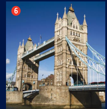
6 Tower Bridge One of London's great Victorian engineering achievements, the Olympic rings suspended from its towers formed the iconic image of London 2012.