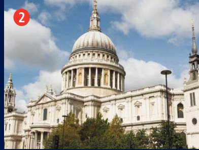
2 St Paul's Cathedral Christopher Wren's masterpiece, built between 1675 and 1711 after the Great Fire of London. The dome rivals that of St Peter's Basilica in Rome.