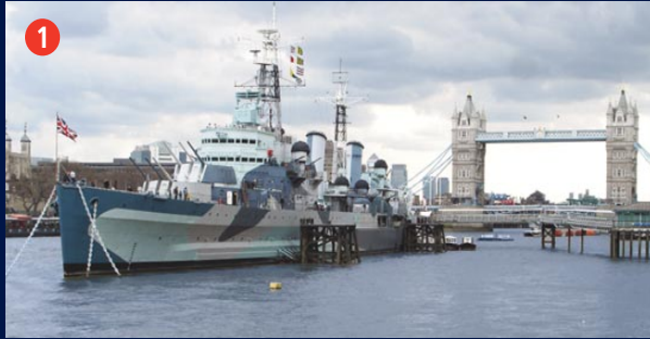
1 HMS Belfast This Royal Navy battle-cruiser from the second World War is now a living museum moored in the Thames opposite the Tower – nine decks of seafaring history.